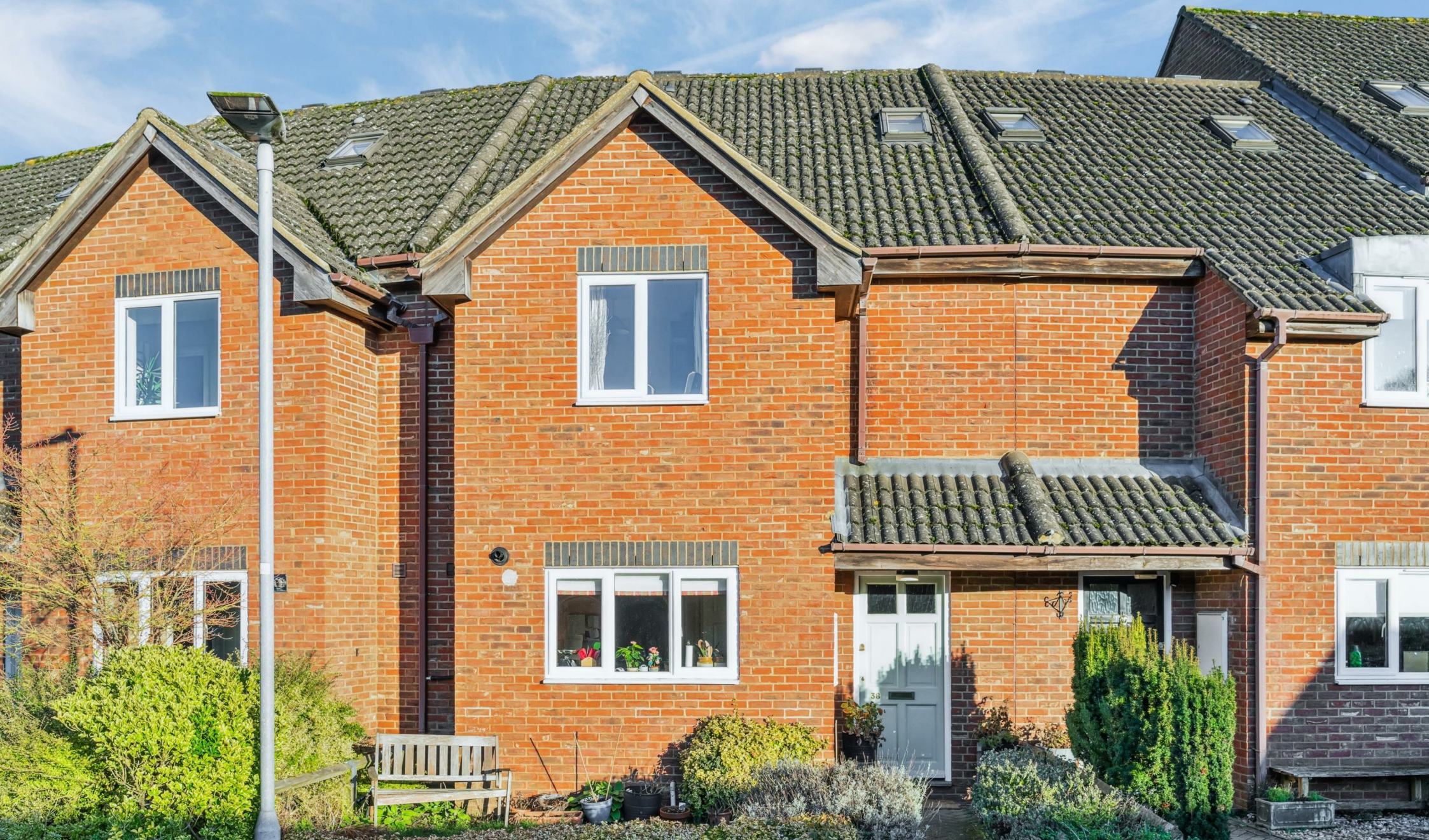
Twin Foxes, Knebworth